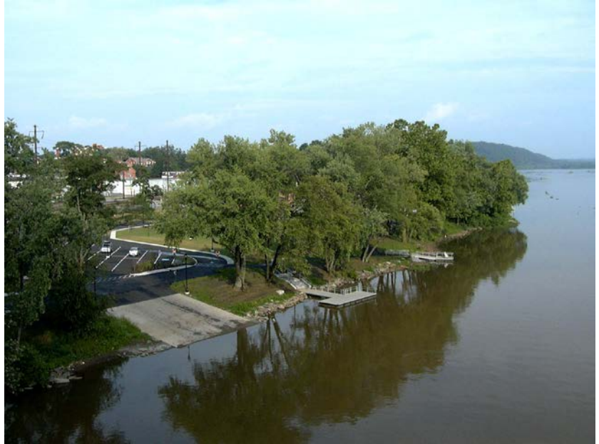
Susquehanna River Park. Used by permission.

Several parks in the borough of Columbia were run down, and a master plan identified the need for improvements. Mayor Leo Lutz started revitalizing, purchasing more land for the park system. One example is the Susquehanna River Park, four acres now refitted with a trail system and a new building with educational center. The borough obtained several grants to fund this project.