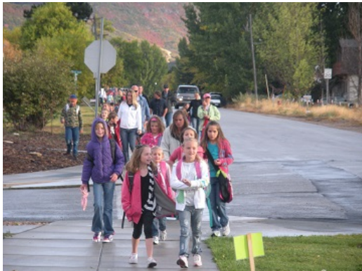
Kids Walk to School, Wasatch County, Utah. Used with permission.

The towns and county have collaborated with the school boards on addressing policies and ensuring the safety of kids walking to school.