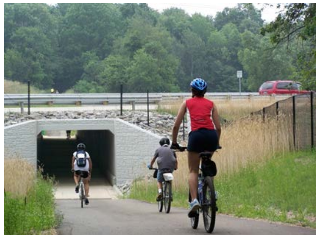
Trout Run Trail Segment 8. Used with permission.