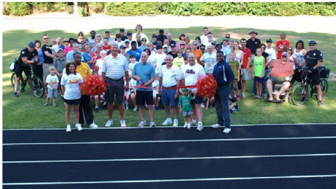
Rubberized track ribbon cutting. Used by permission of the mayor's office.