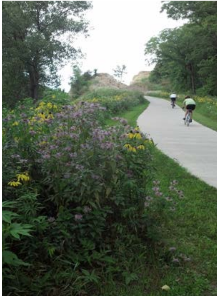
Trout Run Trail improvements, Decorah, Iowa.

A project of the National Physical Activity Society