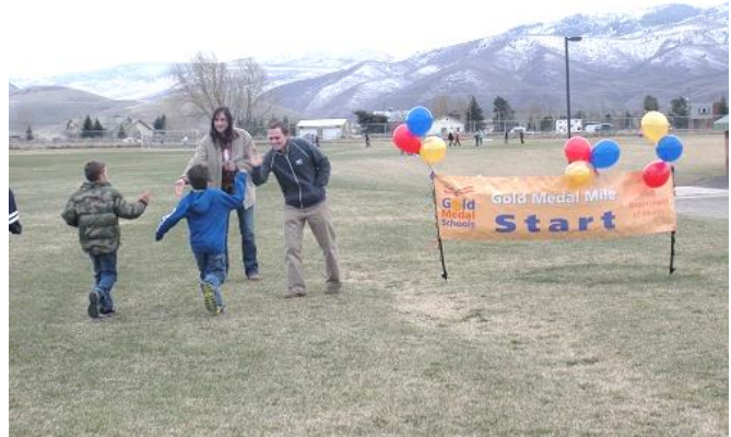
Gold Medal Mile, Wasatch County, Utah.

Plans that began a decade ago were moving along, slowly, until people became excited about urban trails. The discussion progressed from trails in the hills and forests surrounding communities to the in-town assessment of walkability. By partnering with neighboring counties, Heber City (county seat of Wasatch County) brought in a walkable communities expert to take a walk with city planners and political leaders. Now there is more recognition of the need, and more sidewalks are appearing.