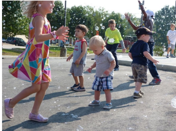
Kids at play in a Brentwood park.